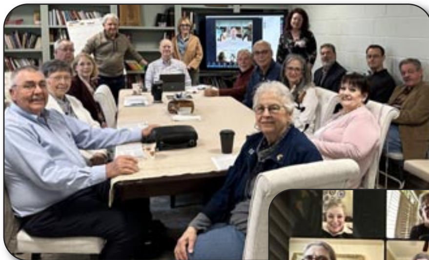
Adult Education Groups

* Does not include market value adjustments.